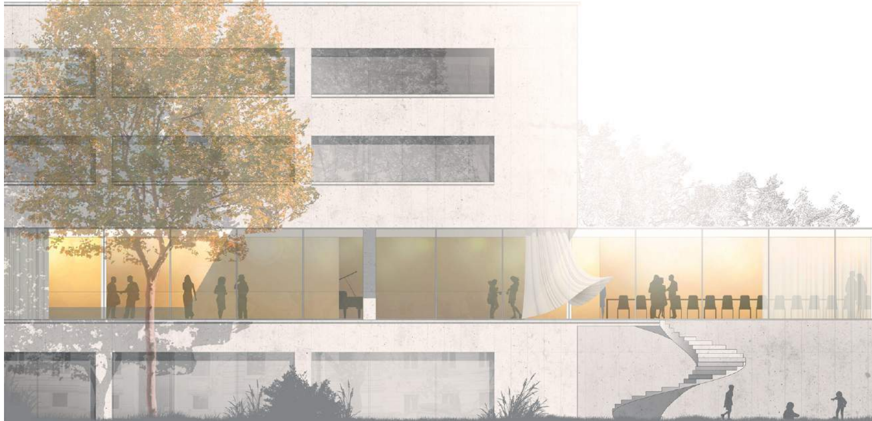
German Embassy Austria, Vienna / Schulz + Schulz Architekten, Leipzig, Germany