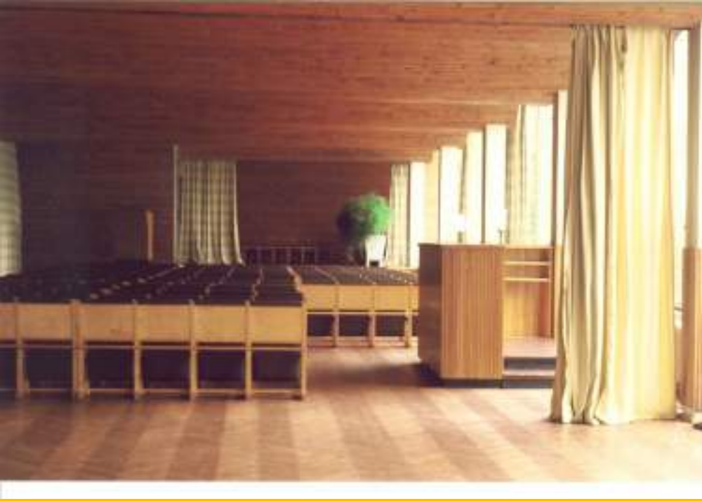
Viipuri Library, Vyborg Russia, Alvar Aalto 1935