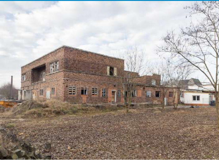
Diary Farm Arnstadt