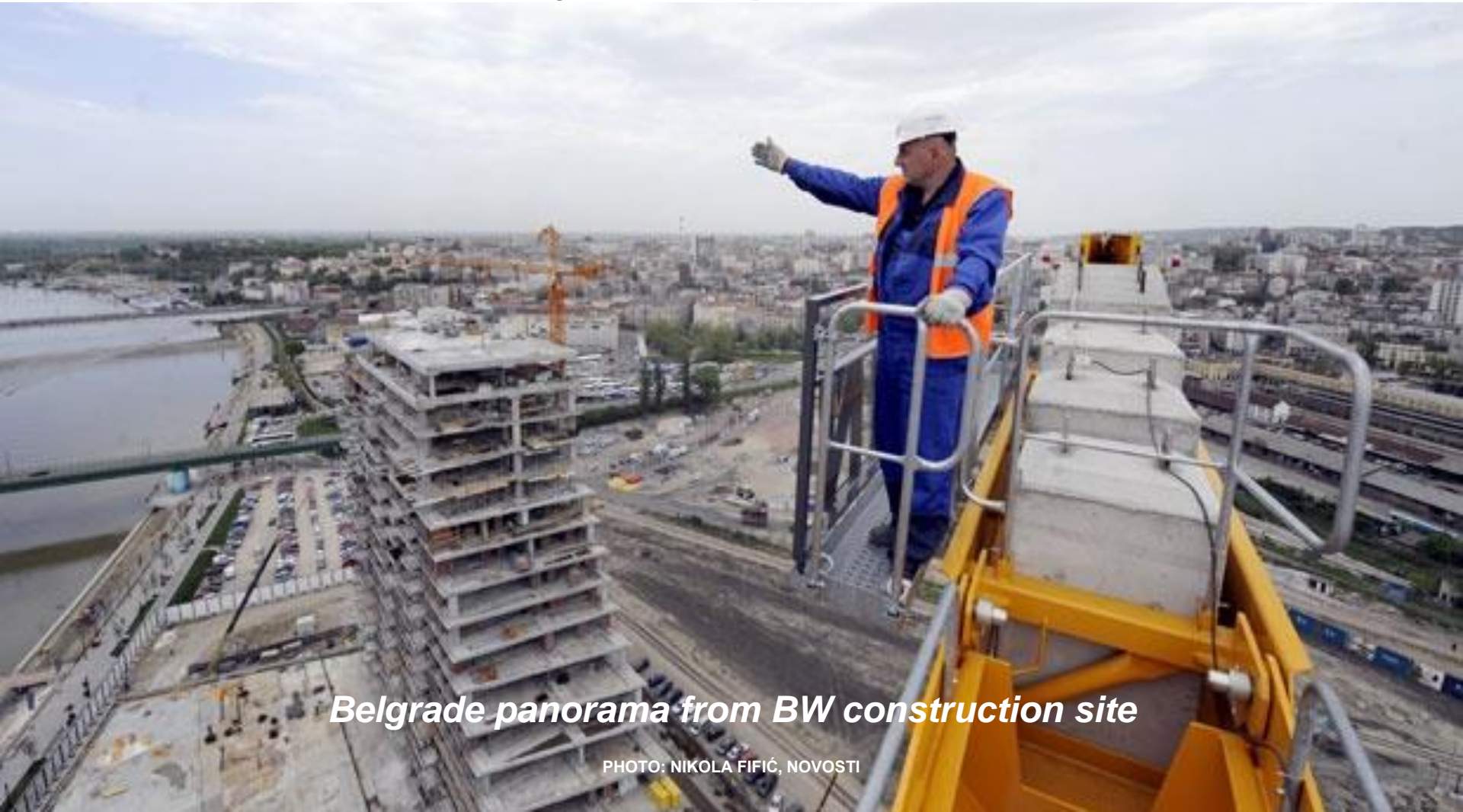
Belgrade panorama from BW construction site