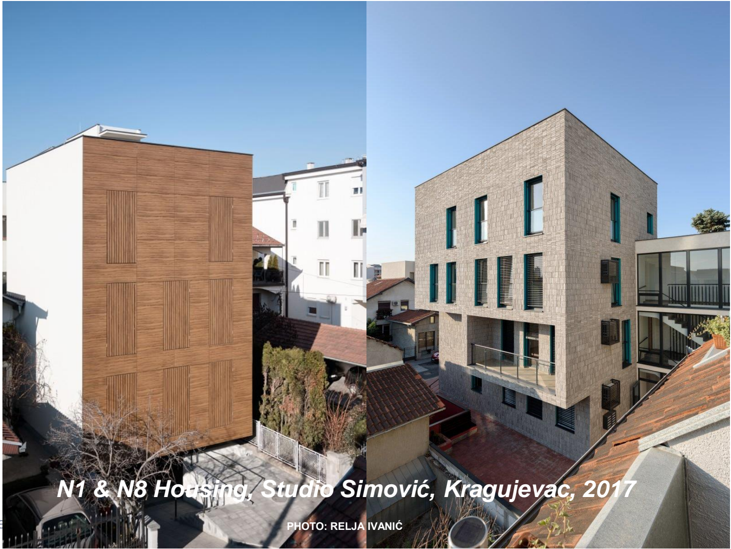
N1 & N8 Housing, Studio Simović, Kragujevac, 2017