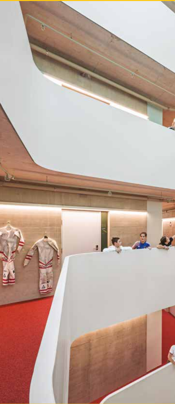
School Campus Neustift, Neustift im Stubaital, Austria Architects: fasch&fuchs.architekten Collaborators: Structural engineering: Werkraum Ingenieure ZTgmbH / Building physics: EXIKON_skins / Collaborator (external): Arch. DI Günter Bösch / Art: Hanna Schimek und Gustav Deutsch