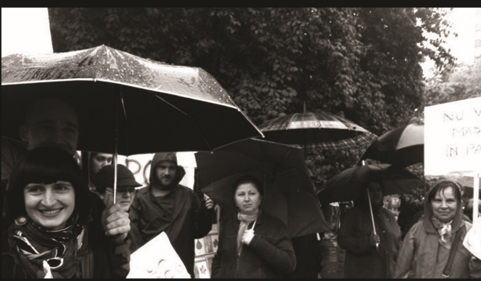
Protest for the park, May 2011