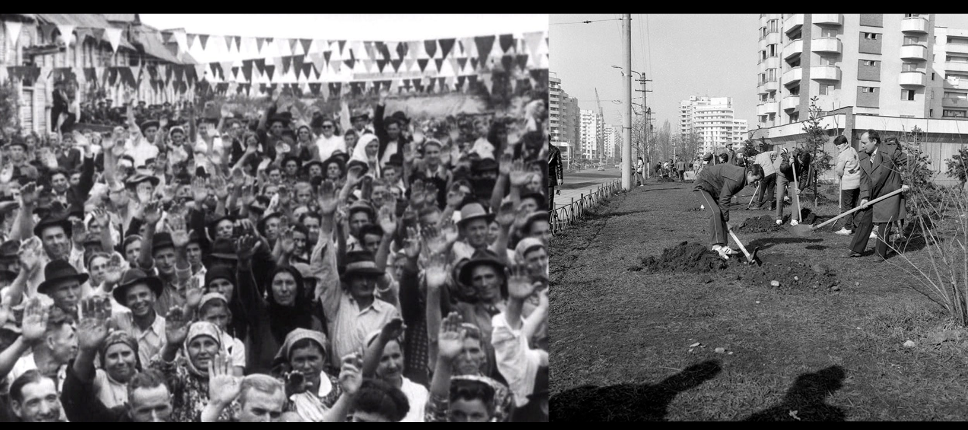
Frame from the DVD Sahia Vintage IV "Comandă Politică", "Festivalul filmului pentru sate" (1960), alb-negru, 10 min.