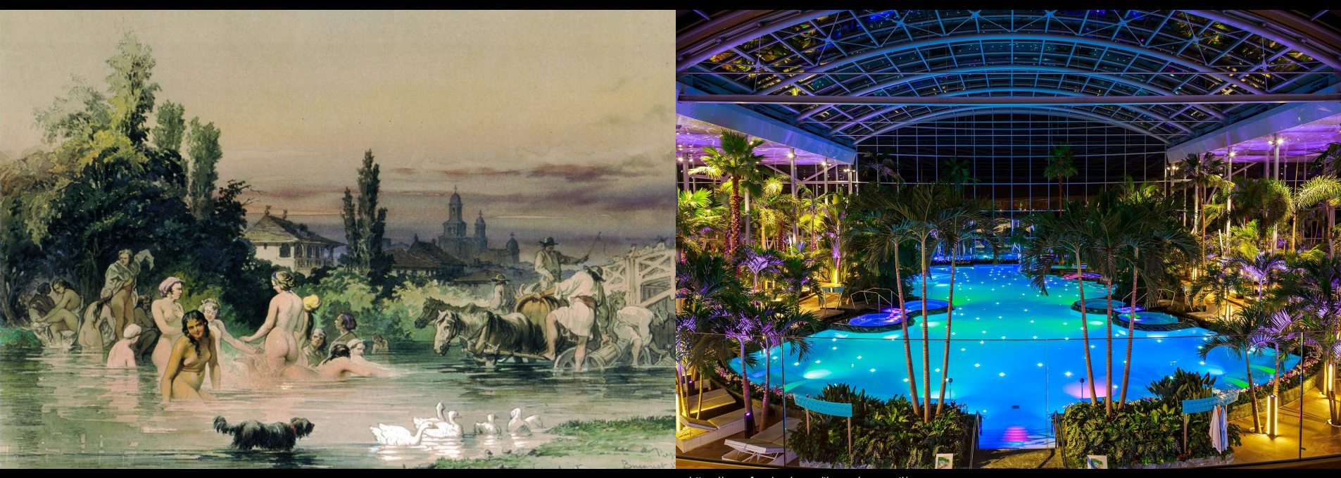
Dâmboviţa apă dulce, Amedeo Preziosi, 1868