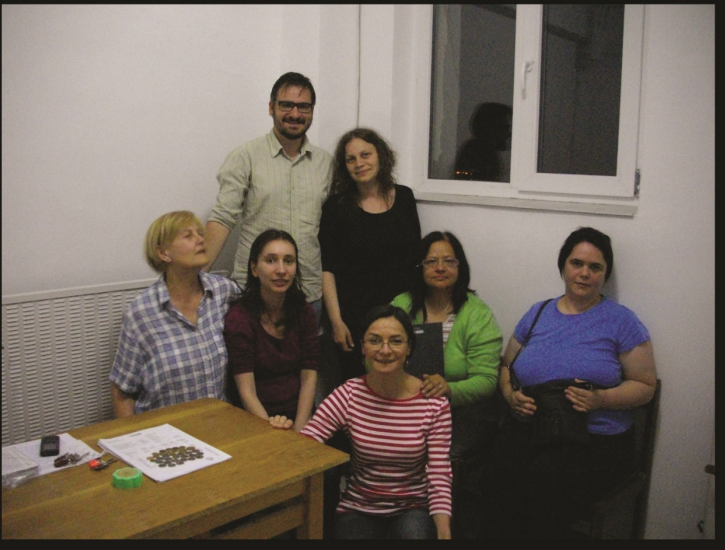
Work meeting - in an apartment building