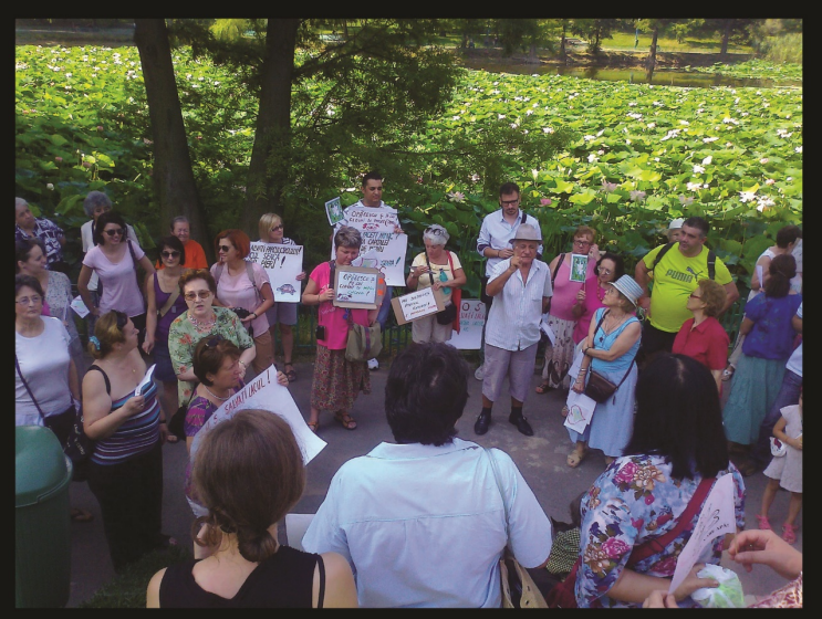
Protest for the lake, July 2013