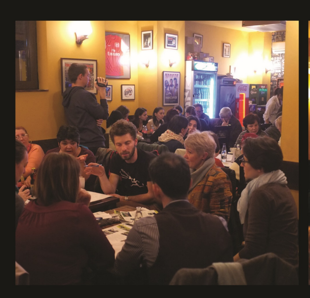
Public cafe, 2015