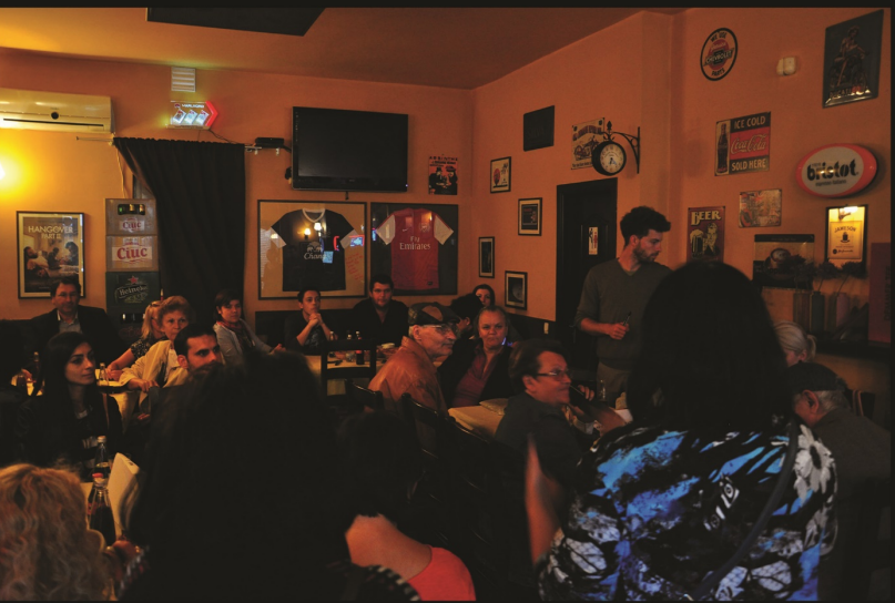
Public cafe, 2014