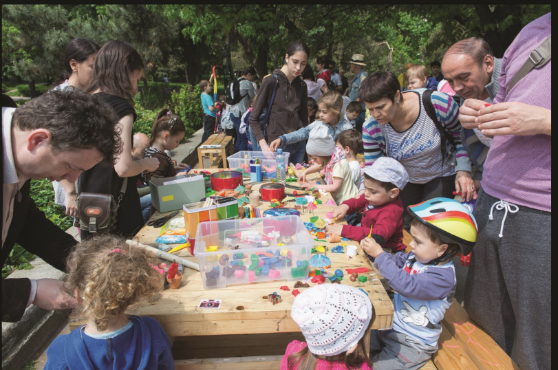
Community event, May 2015