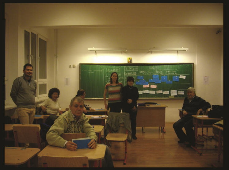
Work meeting - in a school