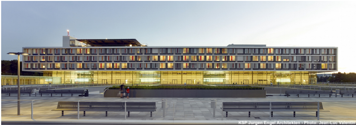
KSP Jürgen Engel Architekten