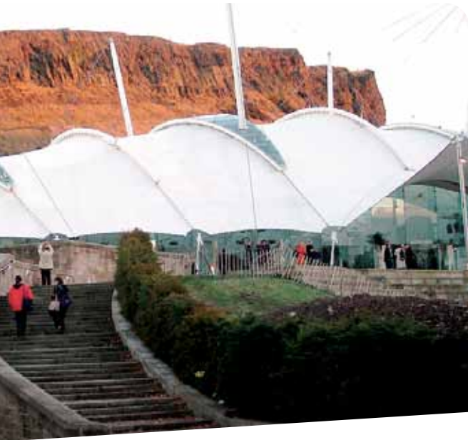
"Our Dynamic Earth" Building, Edinburgh, Scotland Michael Hopkins & Partners, Architects

mately 13% less energy than today, saving 100 billion euro and around 780 million tonnes of CO 2 each year. The Commission proposed that the use of fuel efficient vehicles for transport is accelerated; tougher standards and better labelling be introduced for appliances; improved energy performance of the EU's existing buildings and improved efficiency of heat and electricity generation, transmission and distribution. The Commission also proposed a new