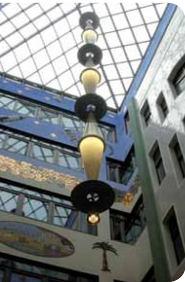
Shopping Arcade Renovation, Leipzig, Germany

Sustainable architectural design integrates consideration of resource conservation and energy efficiency, healthy buildings and materials, ecologically and socially sensitive land-use, protection and enhancement of biodiversity and an aesthetic sensitivity that inspires, affirms, and ennobles. Sustainable architectural design significantly reduces adverse human impacts on the natural environment while improving quality of life and economic well-being.