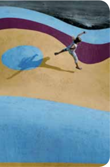
Hellerup Skole, Copenhagen, Denmark Arkitema, Architects