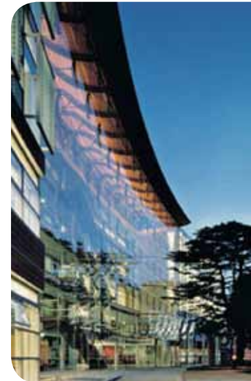
Fingal County Office, Ireland Bucholz McEvoy, Architects

The design and construction of a building which takes optimal advantage of its environment need not impose any significant additional capital cost, and although it may require somewhat increased resources to design compared to more highly-engineered 'conventional' buildings it should be significantly cheaper to operate.