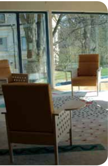
Library, Architecture Museum, Stockholm, Sweden Rafael Moneo, Architect

Energy and sustainability issues cannot be considered only in their technical dimensions as of their nature these approaches and systems can have profound architectural implications. A criticism which can fairly be levelled at many early solar buildings, for instance, is that sometimes practically all other considerations were made subservient to energy 'collection'. It must be emphasised that energy efficient architecture and sustainable building is not a style, as will be evident from consideration of successful case studies. The spatial experience in a more sustainable architecture is not necessarily distinctive: except in so far as passive solar buildings, buildings designed to be responsive to climate and ambient conditions, may generate interiors with a dynamic quality informed by changes in daylight and the sun's availability and position, with spaces featuring a sense of the diurnal and seasonal changes in the surrounding environment.