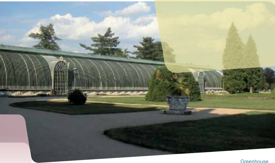
Greenhouse, Czech Republic P H Devignes, Architect

The building industry has a key role to play in any agenda for sustainable development for the 21 st century. The built environment represents a substantial and relatively stable environmental resource. Most buildings survive for several decades, and very many survive for centuries. As the community's principal physical asset, getting good value requires that the building's full life cycle be considered, avoiding short-sighted attempts to merely minimise initial cost. A strategy on sustainable development will seek to prolong the life of existing structures, and indeed to prolong the utilisation of the materials with which they were originally constructed. Adaptation is usually preferable to new building, and upgrading of performance usually represents an efficient deployment of resources.