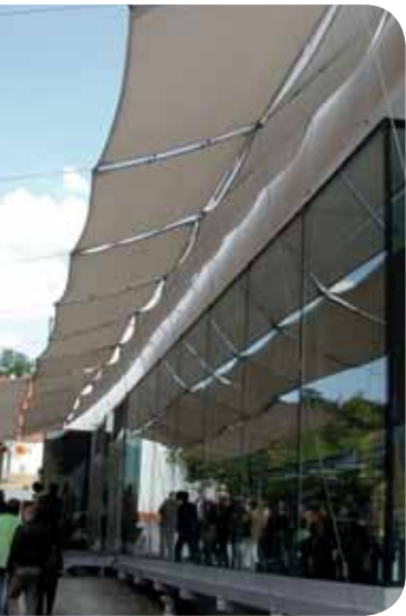
Haus Im Puls, Neusiedl Am See, Austria Habritter Hillerbrand, Architects

By adopting Contraction and Convergence as one element of a four-part policy proposal the RIBA aims to achieve greater public awareness of the threat that climate change poses and it is using the policy to lobby influential organisations and government. Another example is the recent production, by the CNOA 3 in France of an informative and instructive DVD on the topic of sustainable development. The DVD sets out the policy of the CNOA and provides documentaries on several examples of good practice that will permit its members to learn in detail about the benefits of adopting a sustainability-oriented approach to their work.