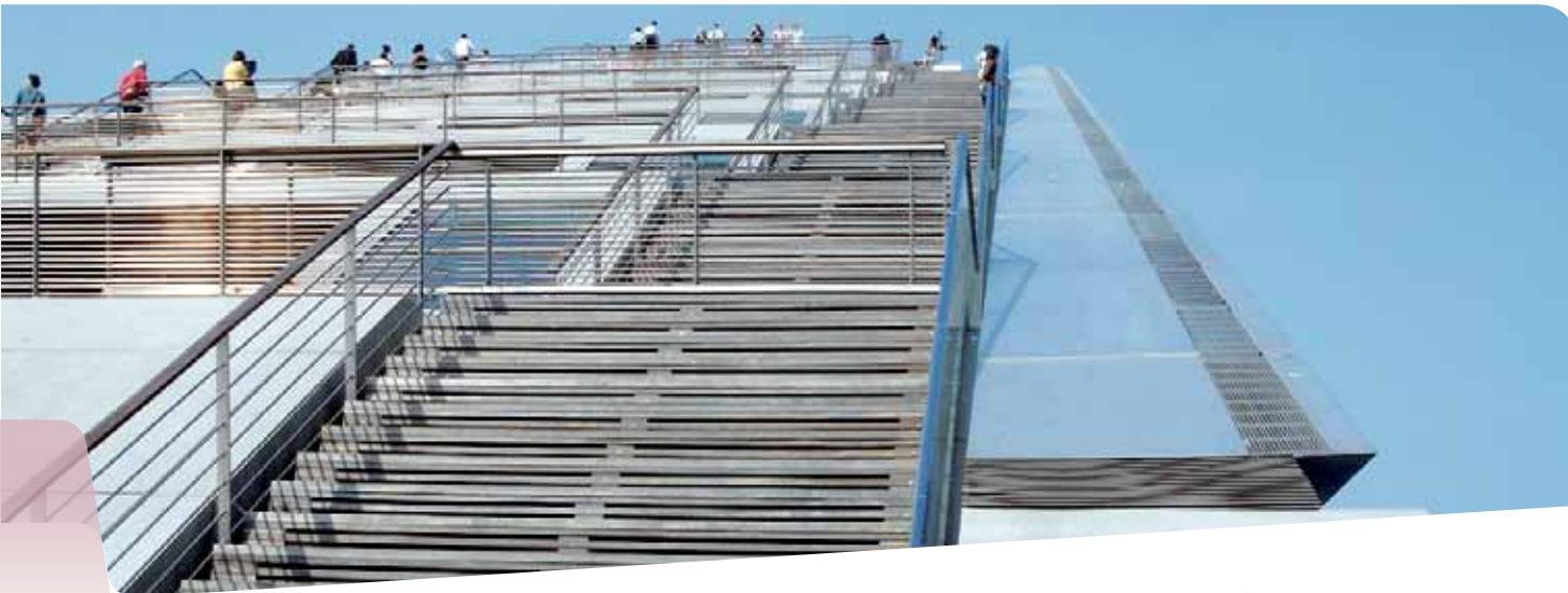
Dockland Office Building, Hamburg, Germany Bothe Richter Teherani, Architect

Following these propositions, the European Union committed itself, in March 2008, to cut greenhouse gas emissions by at least 20% by 2020, in particular through energy efficiency