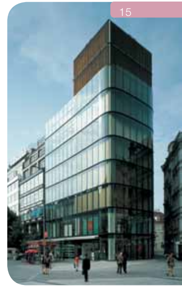
Palace Euro, Prague, Czech Republic DaM s.r.o., Architects

international agreement on energy efficiency. Since the adoption of these binding targets, progress has been made by the re-casting or revision of several key EU Directives on the energy performance of buildings, on the eco-labelling of energy-related products and on the eco-design of energy using products. Furthermore, the European Economic Recovery Plan, adopted in December 2008, foresees substantial investment in the construction sector and specifically in the energy efficiency upgrading of existing buildings. In this context all the actors from the construction sector have come together to establish, with the European Commission, a European Initiative in the form of a Public-Private Partnership that will steer investment in research and development in the field of energy efficiency of buildings.